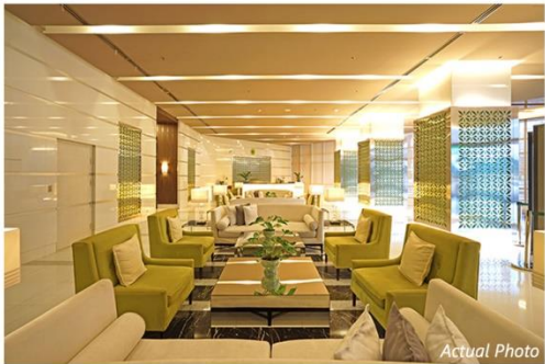
WEST TOWER LOBBY

Twin Oaks Place East & West Towers feature studio units, and one-bedroom flats while Twin Oaks Place West Tower also offers one and two bedroom lofts. Both towers have three-level retail podiums and two floors of amenities.