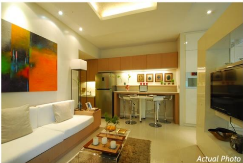
PREMIUM STUDIO (31 to 36sqm*)