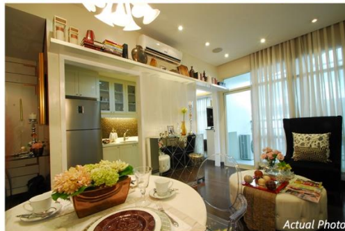
ONE BEDROOM (40 to 48sqm*)