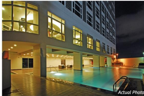
WEST TOWER TWO LEVELS OF AMENITIES