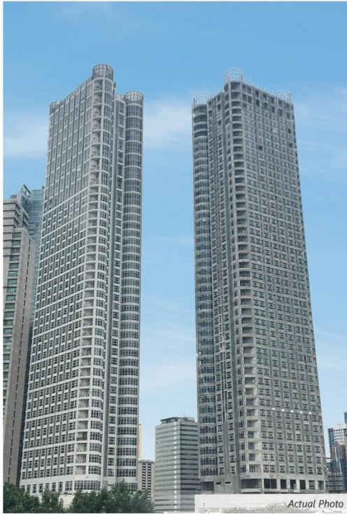
West Tower - Completed East Tower - Under construction

Greenfield District is a carefully designed city that lies at the heart of the metropolis, providing people high-tech conveniences combined with natural wonders, and a true break from the chaos and congestion of the metro.